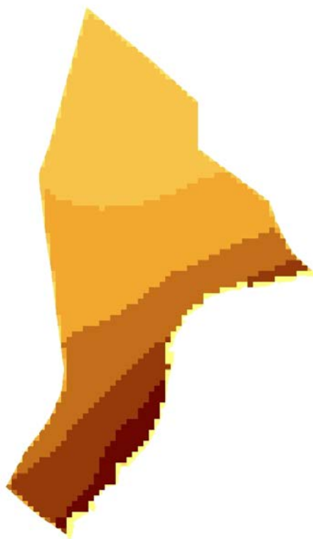
Example map 1c: Total nitrogen deposition on national continental shelf, 5 x 5 km