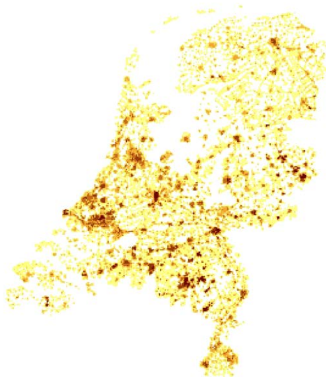
Example map 1b: total nitrogen deposition on paved and drained surfaces, 1 x 1 km